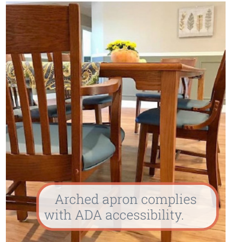
Arched apron complies with ADA accessibility.