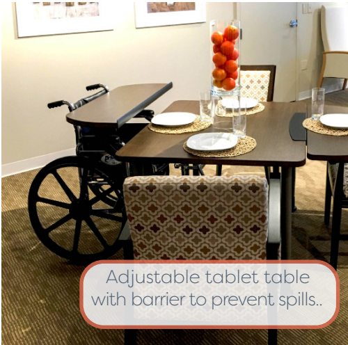
Adjustable tablet table with barrier to prevent spills..